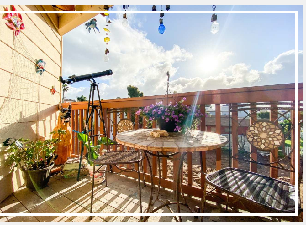
If your home is currently listed with another agent, this is not meant to be a solicitation.

Seller will consider offers between $399,000 and $409,000. FHA/VA complex Just 2 blocks from the beach! Private Balcony. Granite counters, stainless steel appliances, dishwasher, new paint & carpet,tile flooring in kitchen and bath, and crown moulding at ceilings and high baseboards. Underground parking garage, gated complex. Beautiful gated & very quiet complex, You can hear Ocean & good views on upper common area and laundry room 2nd & 3rd level. Unit on 2nd floor. Large secure storage room in garage.